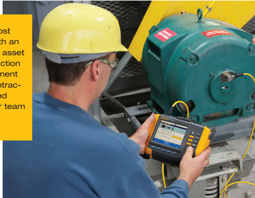
The 810 Vibration Tester monitors an operational motor.

In industrial and manufacturing environments, some 90% of the equipment are in the category of “rotating” machines, including motors, pumps, fans, compressors, blowers, gears, belts, and other components. Running machinery until failure, an all-to typical strategy, often results in lost production, expensive repairs, overtime, and forced purchases. Studies over 25 years have documented the savings that results from a vibration testing program. Indeed, the savings show a 20:1 benefit-to-cost ratio for vibration testing programs. If you spot early warnings of impending machine failure, your maintenance staff can schedule repairs before the problems extend to other parts of the machine or down the line. That improves equipment lifespan and return on assets (ROA). Here are seven Fluke tools to bolster your team’s problem-solving prowess, which can empower them to get to root cause faster, correct the fault, and return the machine to action.